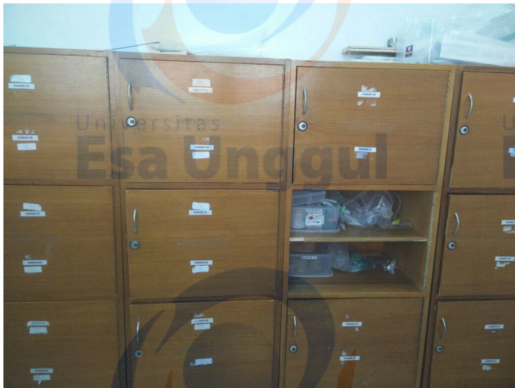
Gambar 5 Lemari Persiapan Obat Pasien