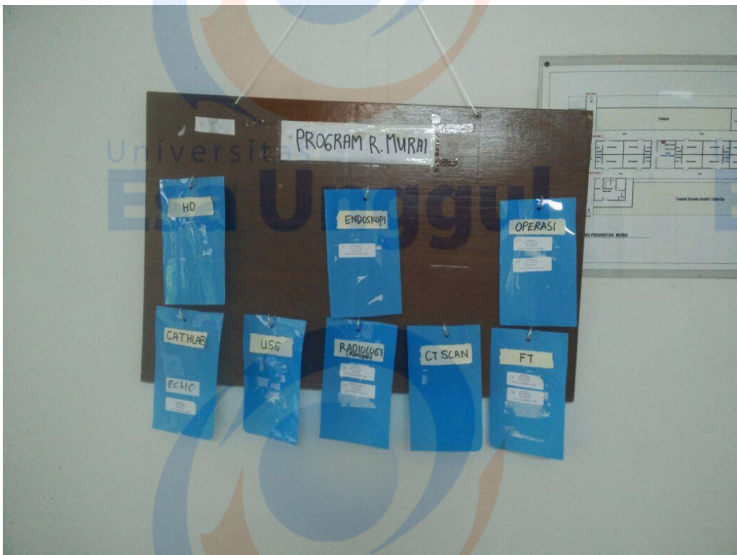
Gambar 4 Papan Program Ruang Murai