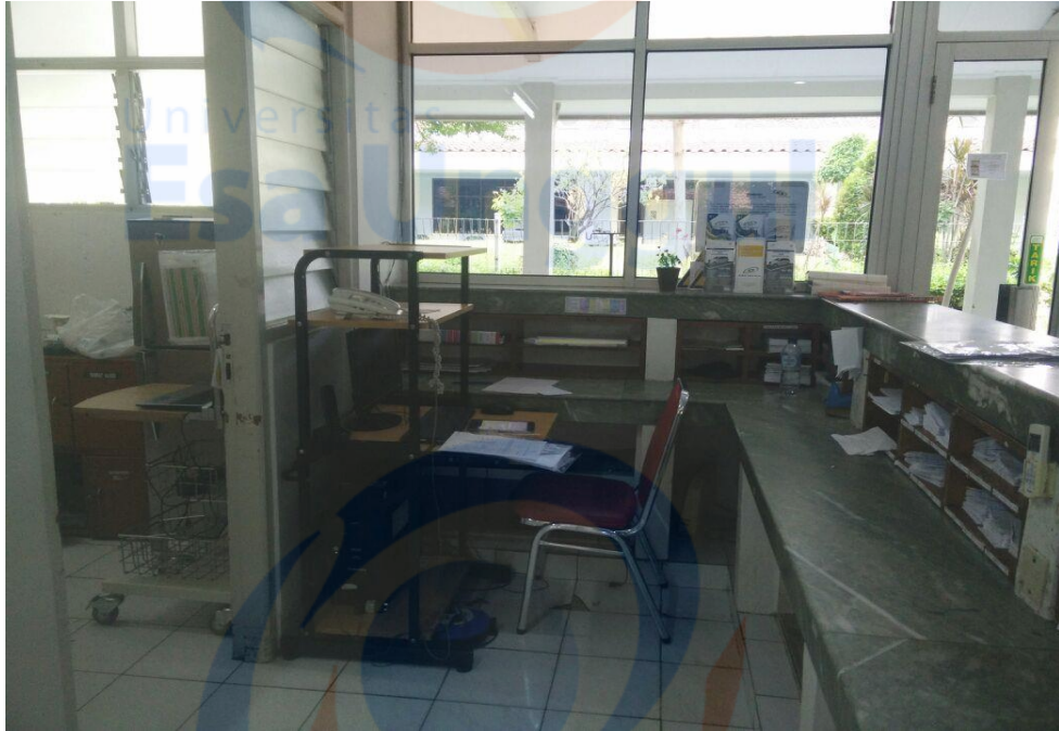
Gambar 1 Nurse Station