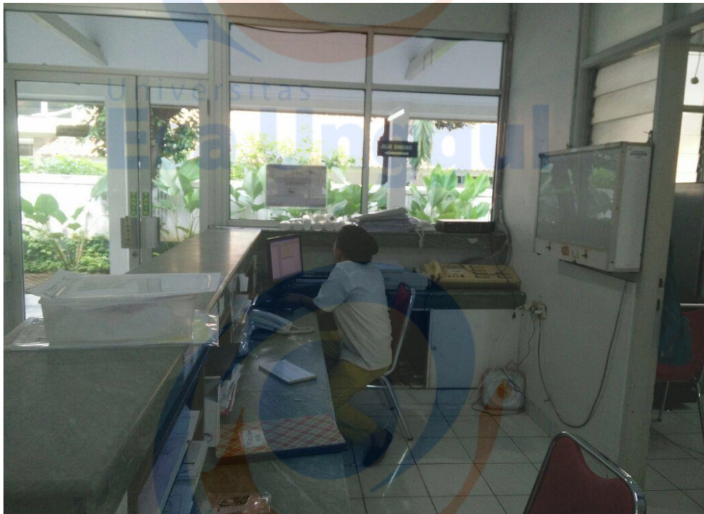
Gambar 2 Nurse Stasion