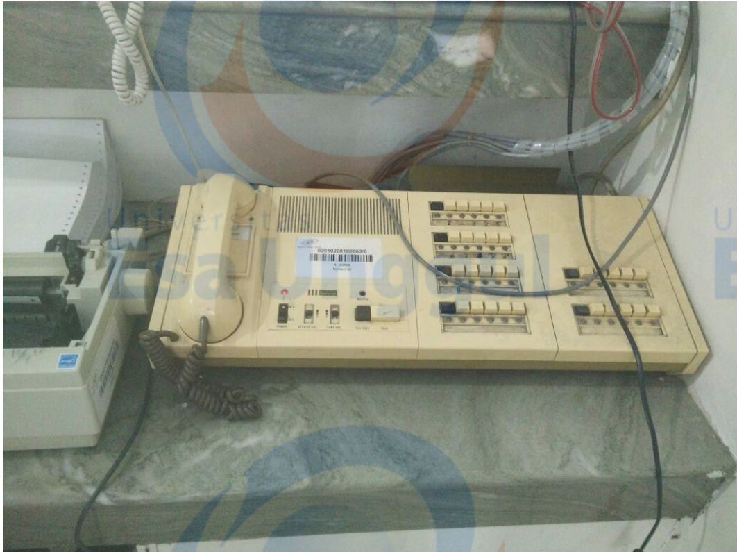
Gambar 3 Sistem Nurse Call